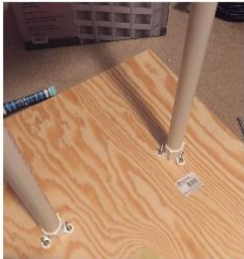
Turned feet in opposite direction, for more stability as it rocks. Center to Center width is 12".