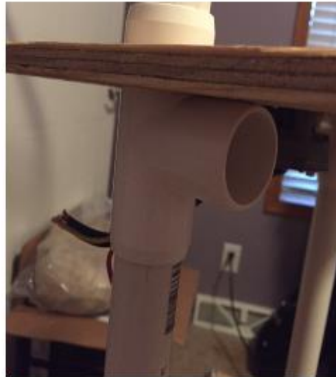
Turned T's, one forward and one back, for stability of wood motor base.