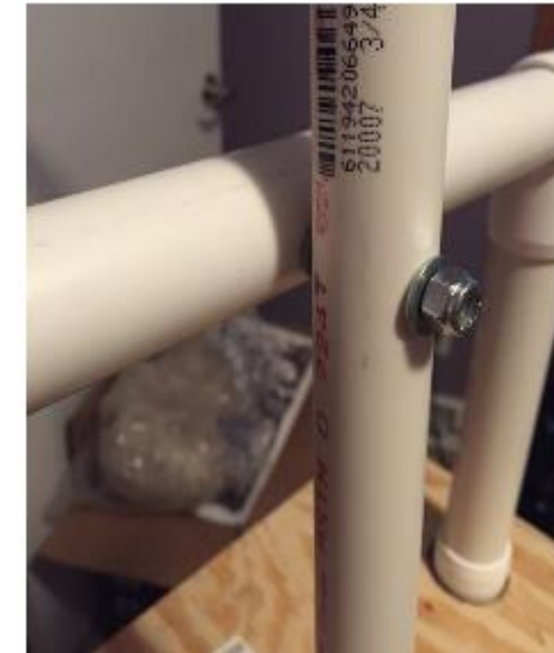
Bolt is located 7.25" up from bottom of spine.