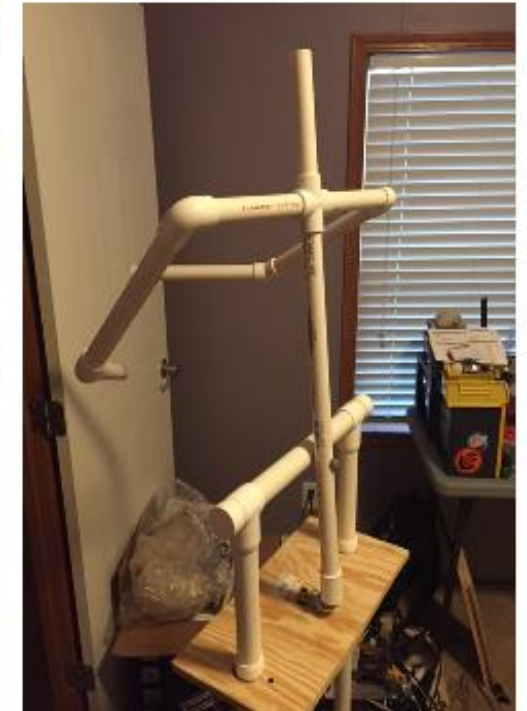
Used a 1/4"-20x3" bolt for waist pivot. Placed washer between all pieces, including the bolt & nut.